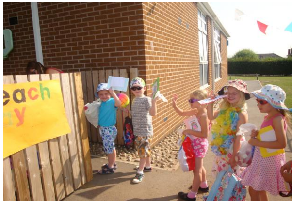
Foundation children enjoying a fun filled beach day during the summer.

For those children who have been given a place at Holy Cross there is an exciting opportunity for them to visit our school before they start full time. During the half-term before your child is due to start school, your child will be invited, for a number of days, to join our Reception class and to enjoy lunch together. This will provide your child with the opportunity to get to know our school, the teachers and make new friends.