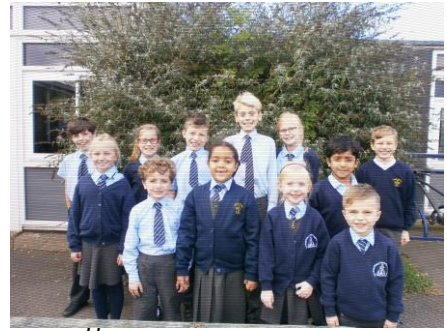
H Holy Cross Eco-Warriors

Two children from each class are voted to become Eco Warriors for the year. They then participate in ecological projects around school. These are some of the jobs they do: compost fruit and vegetable waste; turn off lights when no one is in the room; grow some of our own vegetables; water the plants; recycle paper and cardboard.