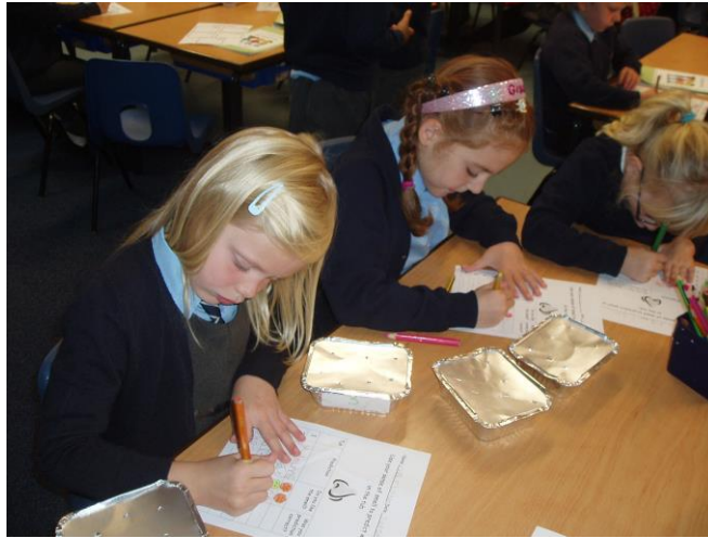
A science experiment

Children are taught in classes, small groups or individually, according to their needs, within the framework of the National Curriculum.