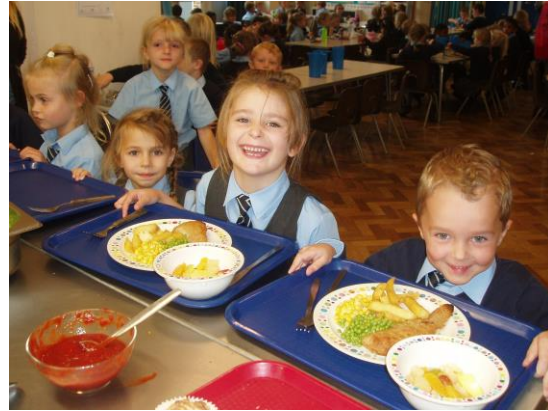
Our delicious and healthy school dinners