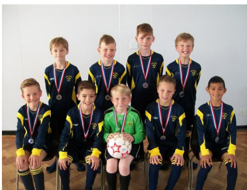
Holy Cross Boys Football Team