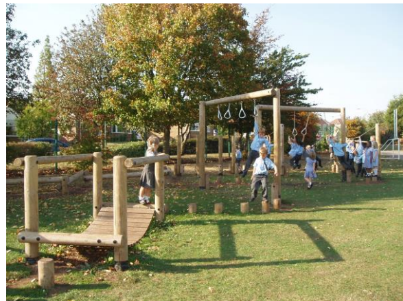
Fun on the trim trail