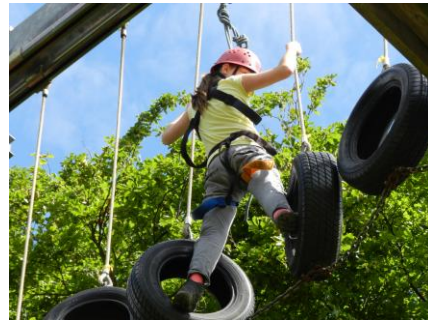
Pupils participate in activities at PGL

Our Year 5 and Year 6 children have the opportunity to visit the PGL Centre at Caythorpe, Lincolnshire. Activities on offer include rock climbing, abseiling, canoeing, raft building, "Leap of Faith", team building exercises, zip wire, quad biking, problem solving and fun with ICT. The children come back glowing from their experiences.