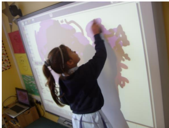
Pupils use wireless laptops during computing lessons Interactive whiteboards are fitted in every class