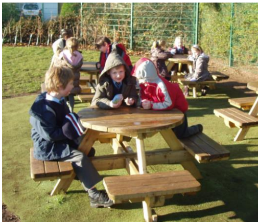
The outdoor classroom

We take our children's security and safety extremely seriously at Holy Cross. The school is surrounded by secure fencing. All visitors can only gain access into our school through the main entrance and are asked to sign in and wear a security badge in order to identify themselves. The children feel secure and safe in our school environment.