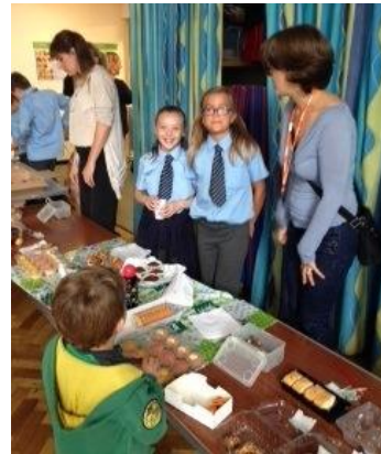
Fundraising cake sale

We have a thriving Parents and Friends Group, which all parents/carers are welcome to join. They are very active in raising funds for the school and in arranging social events for everyone to enjoy. Their involvement has enriched the curriculum for the children and allowed us to purchase many additional resources and equipment. Regular newsletters share in school developments, events and diary dates. We appreciate the support that our parents/carers give to this group.