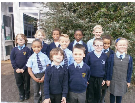
Holy Cross School Council

Our school council was set up to enable the children here at Holy Cross to have a say in the running of their own school. Our children therefore have a greater sense of belonging, become more confident when putting forward ideas and develop a greater understanding of the need to work co-operatively for the good of others. There are two elected school council members from each class. They meet weekly to discuss ideas to improve our school. Decisions are then fed back in class and any issues that arise are discussed. Recent initiatives by the school council have resulted in the purchase of a new trim trail and outdoor classroom, house points and a friendship stop. Their next project is to purchase new small play equipment for the children to use at playtimes and lunch times.